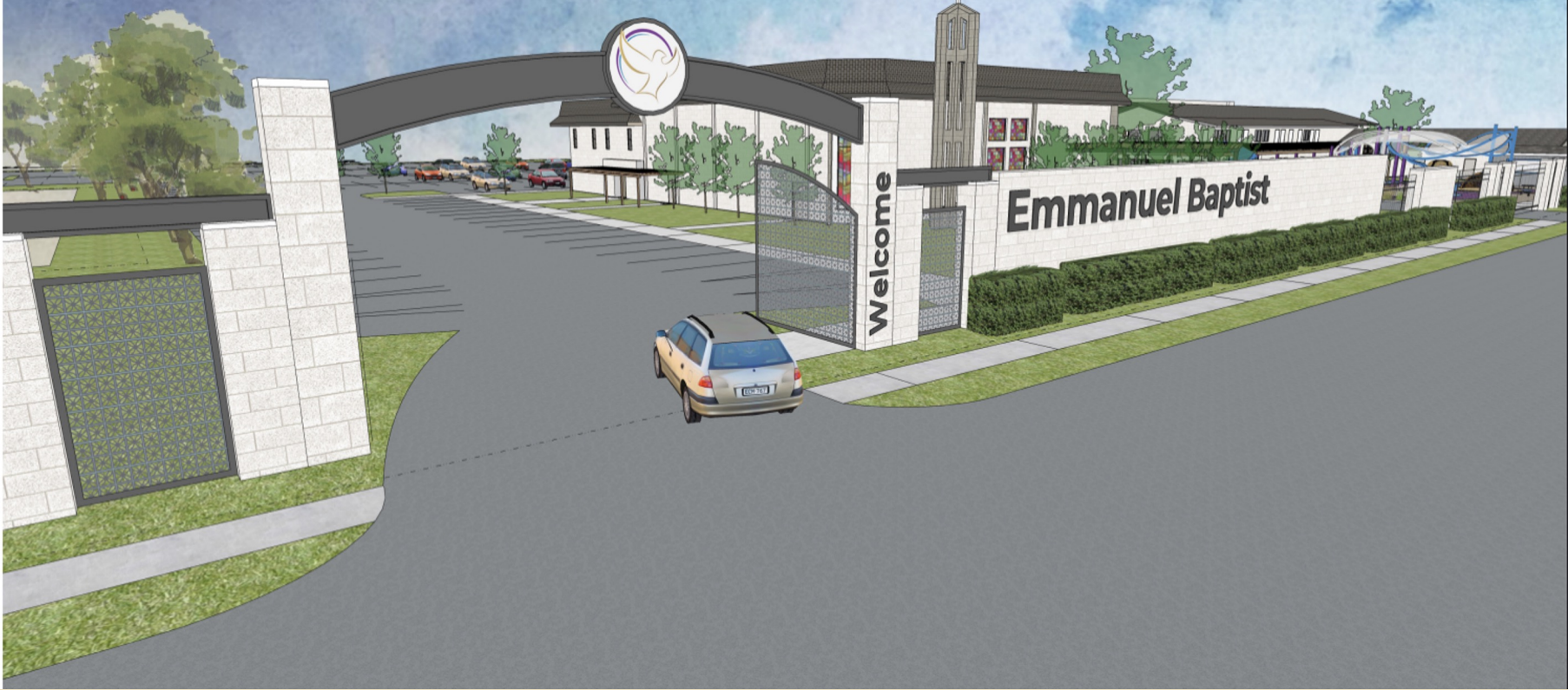
Front of Church